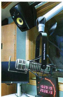
Each of the studios is equipped with an Axia Element broadcast console, KRK VXT6 monitors and EV RE-20 mics

One of the advantages of installing a broadcast system at the Cyberport facility was that it was very easy to get all of the incoming and outgoing phone lines via SIP Trunks. This negated the need to convert to and