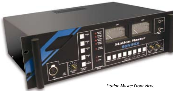
Station Master Front View.

Station Master is part of the Sonifex range of professional audio products designed for building radio stations on a budget. It combines into a single package all the equipment required for audio distribution, studio switching, talkback and monitoring for up to 4 studios.