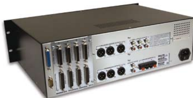
Station Master Rear View.

// Station Master combines all audio distribution, studio switching, talkback and monitoring equipment into a single package. //